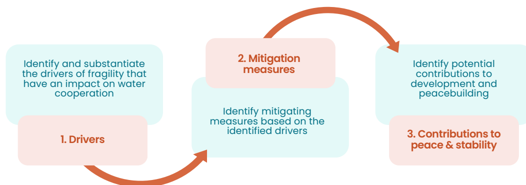
Figure 1: CIWA Framework: Analysis, Actions, and Contributions to Peace

The three steps are captured in the Framework Template (Annex 1).